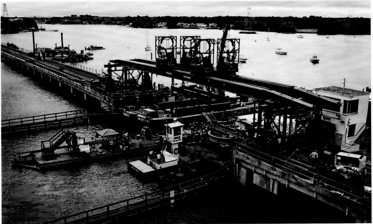
A gantry looms over the railroad bridge spanning the Danvers River in late July, a few days before crews used it to lower a new swing

The MBTA scheduled federally mandated Positive Train Control work on the Newburyport and Rockport lines to coincide with shutdowns related to the bridge work. This will eliminate separate closures on the lines for PTC installation.