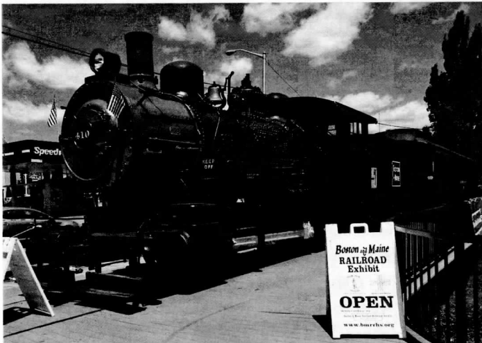
Visitors to the Lowell Folk Festival examined exhibits in the B&M combine and talked with Society members.