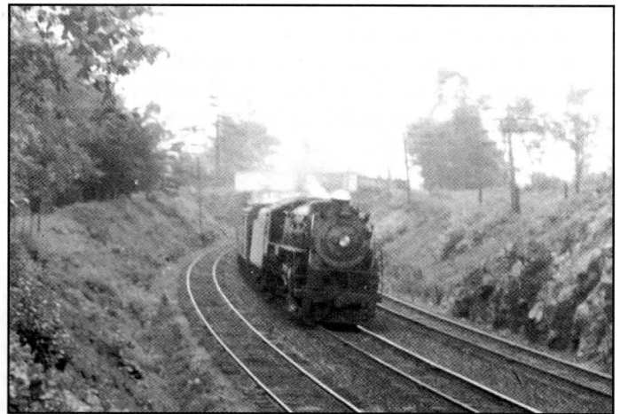
The Camels Hump, B&M #3717 inbound to Boston on the Fitchburg Division passing Mt. Feake (Waltham) on July 4th, 1944.