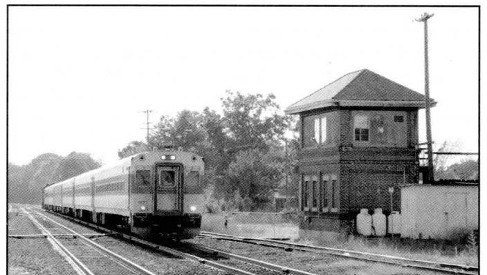
#2412 passes Ayer tower.