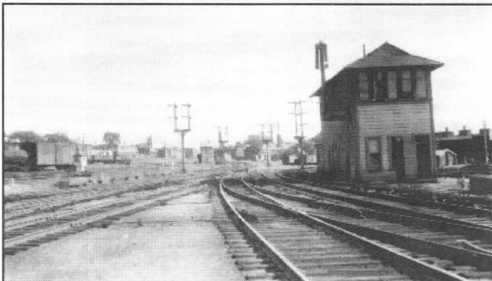
Manchester, NH yard looking south...circa 1930's.