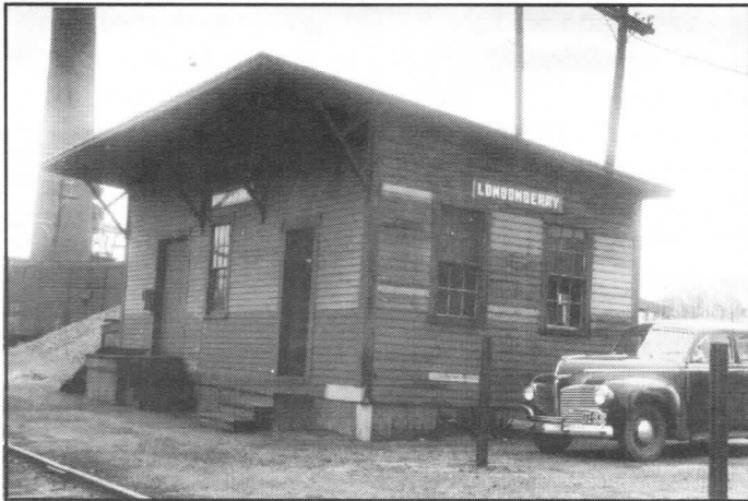
This is Londonderry, NH on the Manchester & Lawrence Branch...the station is actually the former Wilsons station that replaced the station at Londonderry after it burned down in 1921. Wilsons was located in Londonderry approximately 2 miles south of the Londonderry station. The chimney in the background still stands today and is the only remaining "structure" left from that 1921 fire."