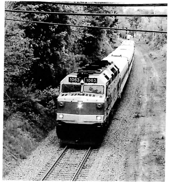
(Above) F40PH-C #1063 in Ipswich on May 17, 1998, heading to Newburyport by the Rt. 1A overhead bridge.