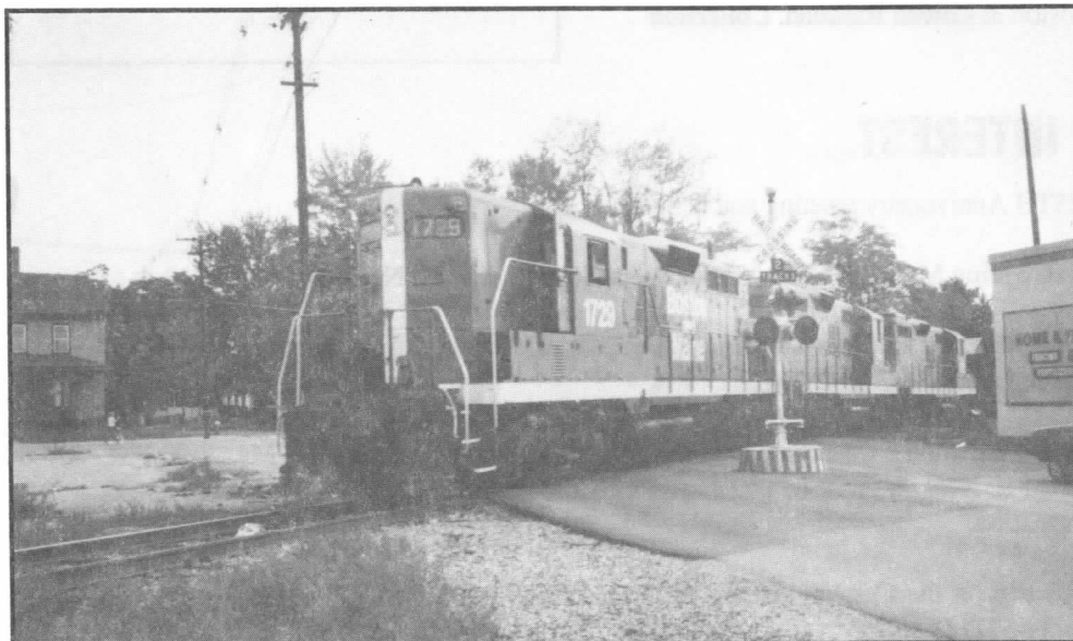
#5 B&M #1729 GP9 blt. 5/57 at Portland St. crossing in Rochester, N.H. in Oct. 1981.