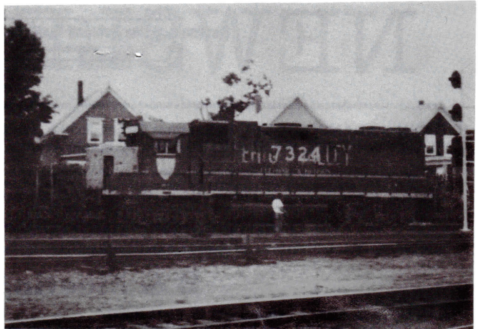
Guess who belongs to this locomotive! It's Delaware & Hudson 7324, or is it? Lehigh Valley paint is coming through, to the point that there's less D&H paint than LV. A maroon, blue and yellow tribute to poor quality paint!