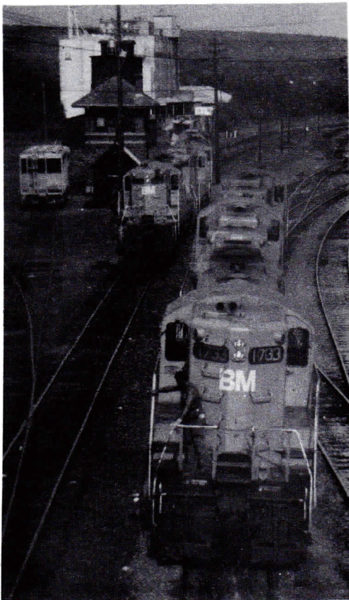
A view from the East Deerfield "Railfans Bridge" from that not-too-long-ago time when B&M blue was the only color to be seen! B&M 1733 was the last "McGinnis" GP-9 to be repainted a few years ago.