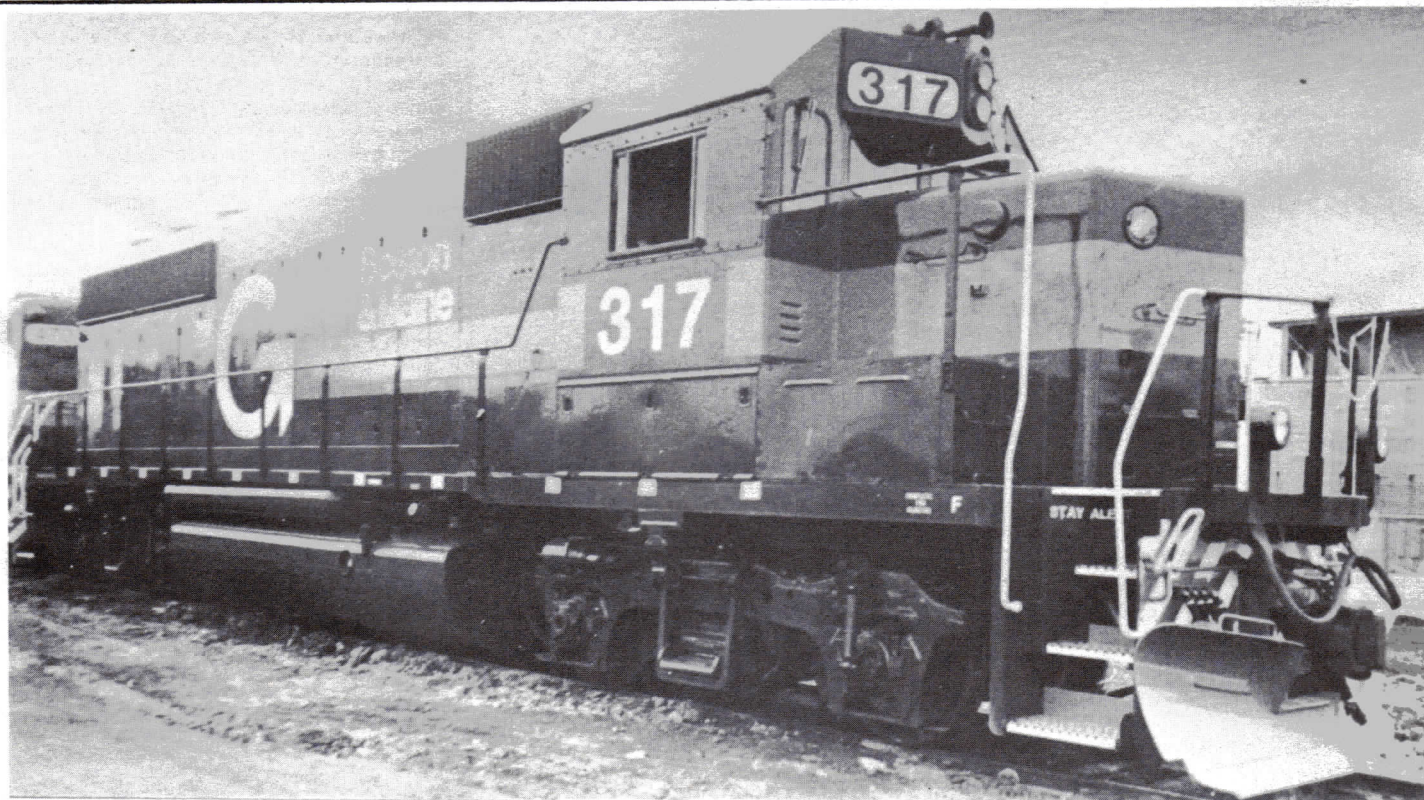
The Boston & Maine Railroad recently unveiled their first Guilford paint scheme. GP40-2 317 carries the colors, and sports new ditch lights and a new Maine Central type Nathan 5 chime horn!!!