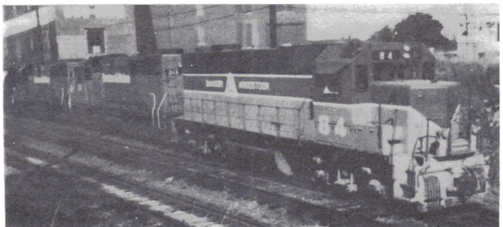
Bangor & Aroostook GP38 #84 leads Boston & Maine GP40-2's 313 and 314 out of the B&M's Lawrence, Mass yard on October 18, 1983. The units were in charge of freight LASE (Lawrence to Selkirk). BAR 87 has also been used on the NWLA/LASE turn.