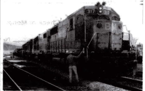
Practicing a tradition as old as railroading itself, the tower operator in Ayer, Mass., hands up orders to westbound B&M symbol freight POSP on Feb. 27, 1982

As a final point, today this location is the eastern terminus of the trackage in Keene. This being the result of the removal of trackage south of there. The automatic flashers are still in place but almost completely destroyed by needless vandalism. A string of Greene Mt. RR boxcars sit on the main line as far as the switch to the Wetterau foods warehouse which, when constructed, eliminated all traces of the N&K roadbed. Special thanks to all who have responded to this, our first, photo quiz for the newsletter. We hope that we can continue these for the enjoyment of all. W.E.ED.