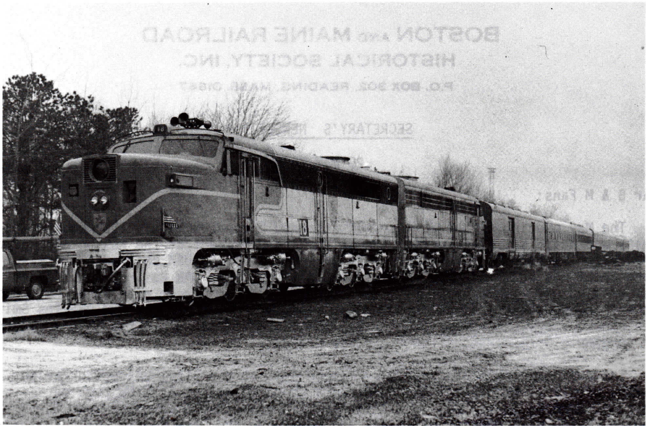
Above: Alco PA-powered inspection train destined to follow the "Alphabet Route", Rigby Yard, S. Portland, Maine, March 19, 1974.