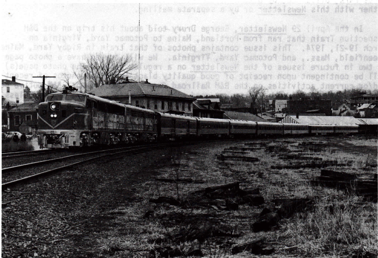
Below: Inspection train at Greenfield, Massachusetts, March 19, 1974.