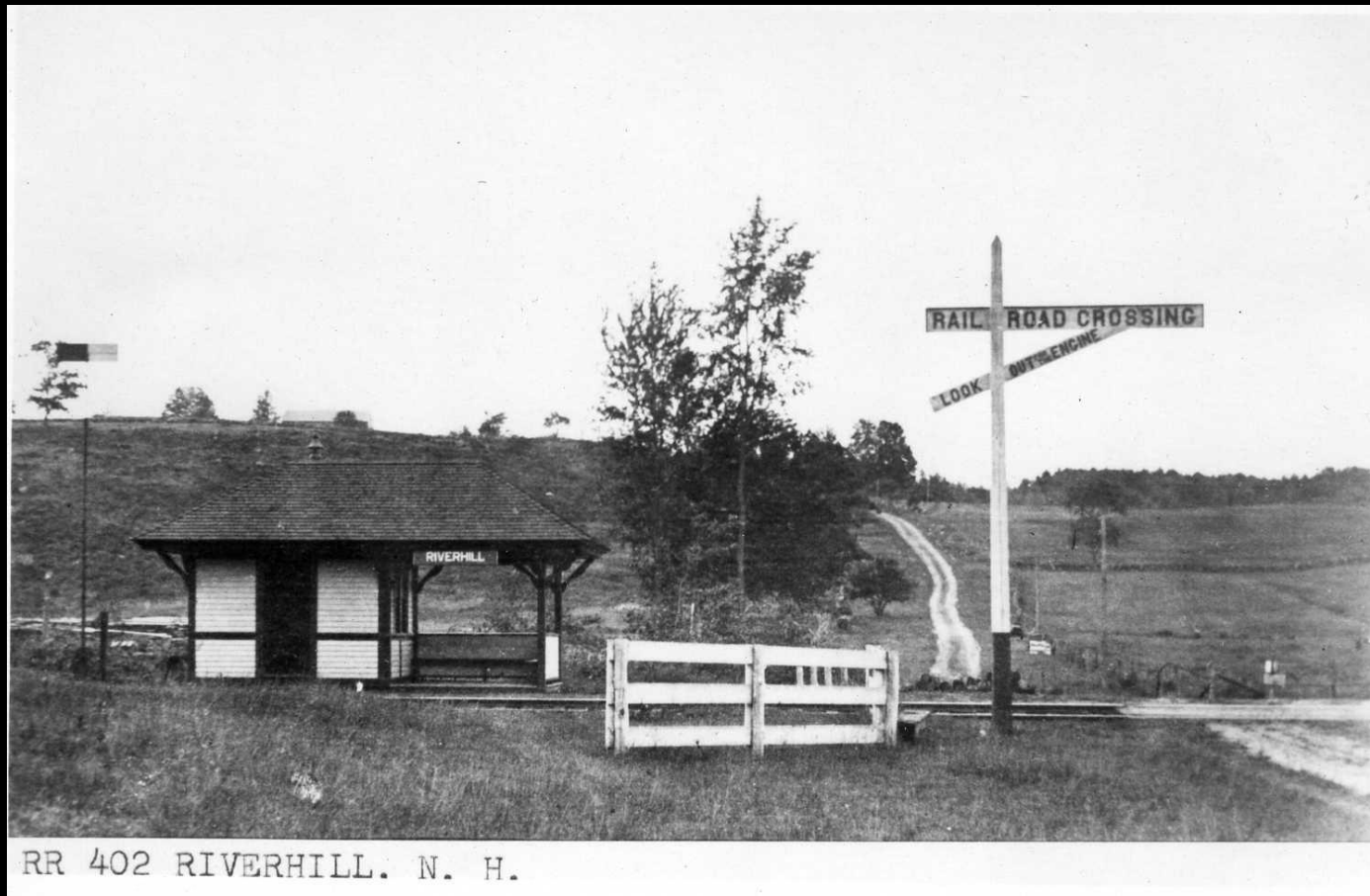
RR 402 RIVERHILL. N. H.