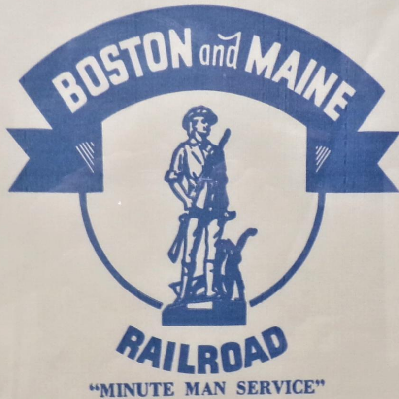
Boston & Maine Railroad "Minute Man Service" 15" x 11" Painting