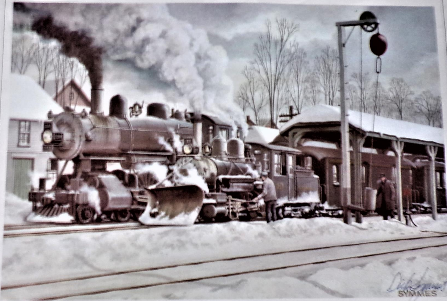
CONTRAST AT FARMINGTON