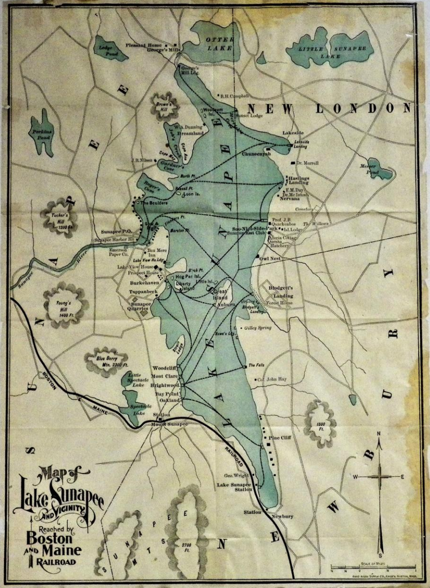
Map of Lake Sunapee AND VICINITY Reached by Boston AND Maine RAILROAD

Good going July 4 to 10, and returning not later than Aug. 1, 1894. Tickets to be good returning must be returned by 10 o'clock by American Express, of Lowell, Mass., or by mail, by 10 o'clock, the latter will be checked.