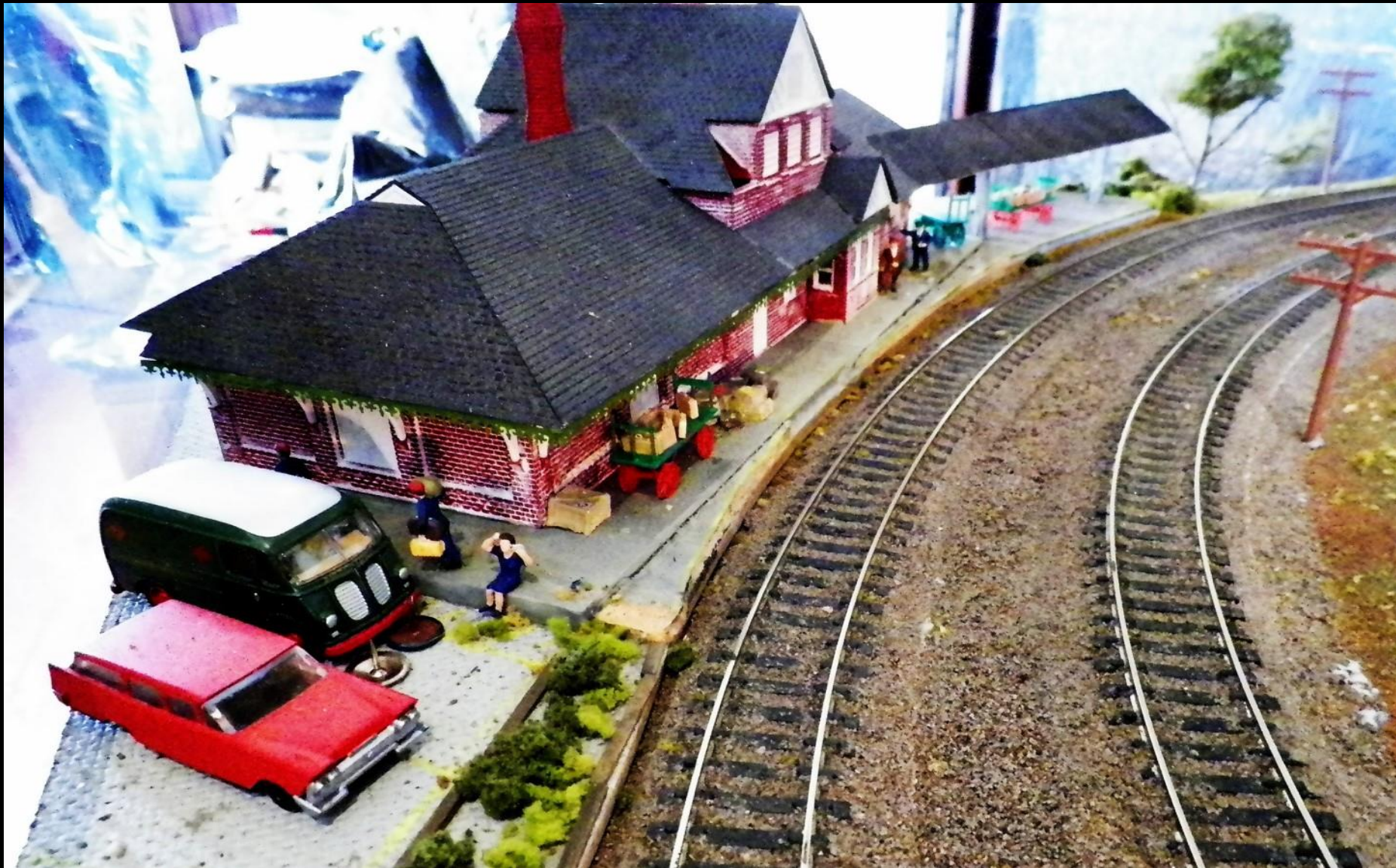
Central Street Station / Trackside 1960's